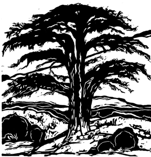
Cedar of Lebanon