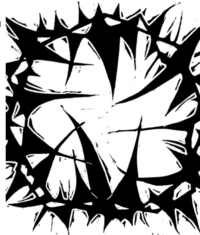
Crown of Thorns